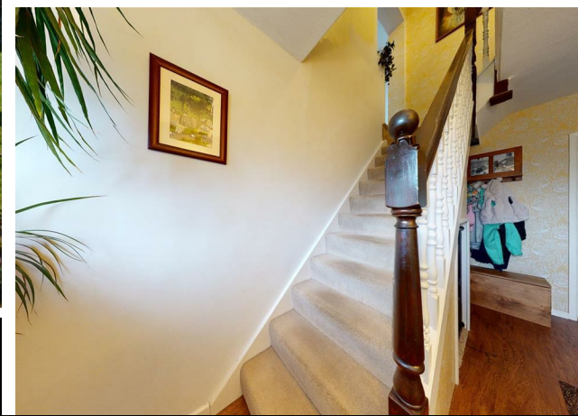
Parkway, Midsomer Norton